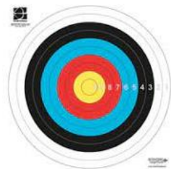
60/40cm face (10 zone)